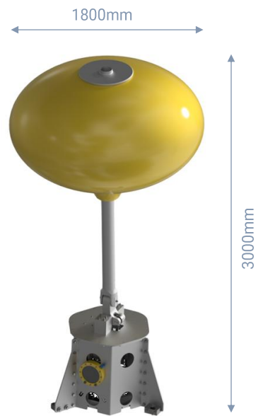
Wave Energy Converter